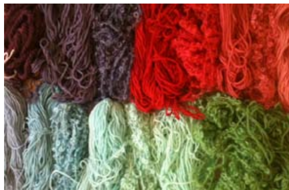
Kool-Aid dyed wool and mohair from Sheep to Shawl